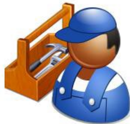
MBE Prime Contractor

Only firms who are certified as an MBE, DBE or ACDBE can fulfill the minority participation goal on a State contract